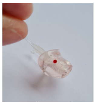
Red = Right

Your hearing aids are marked with colours for left and right aids. Left = Blue Right = Red. Your tubes and moulds also have red and blue markings to help you match them to the correct hearing aid. The coloured dots on your moulds help you orientate the mould. They should face up.